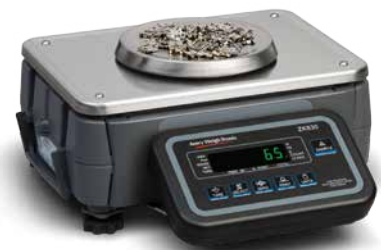
10 lb (5 kg) and 2 lb (1 kg) Models 6 in (150 mm) round platter