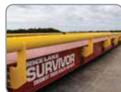
SURVIVOR ® OTR Top access, low profile concrete or steel deck scales