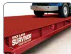
SURVIVOR ® ATV Heavy- and super-duty top access portables