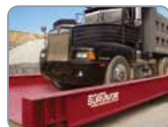
SURVIVOR ® SR Extreme-duty, low profile concrete or steel deck siderail scales