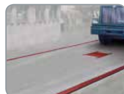
SURVIVOR ® PT Pit-type concrete or steel deck scales