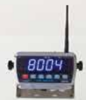
MSI-8004 HD LED Remote Display