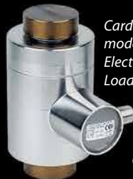
Cardinal model SCA Electronic Load Cells