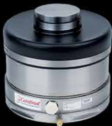
Cardinal model SST Hydraulic Load Cells

Available in 12, 14, and 16-foot wide extra-large scale platforms to easily accommodate off-road vehicles.