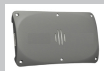
RFID Tags & Reader