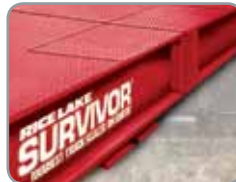
SURVIVOR ® OTR Top access, low profile concrete or steel deck scales