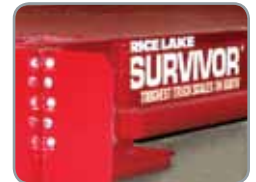
SURVIVOR ® ATV Heavy- and super-duty top access portables