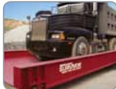
SURVIVOR ® SR Extreme-duty, low profile concrete or steel deck siderail scales