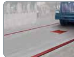
SURVIVOR ® PT Pit-type concrete or steel deck scales