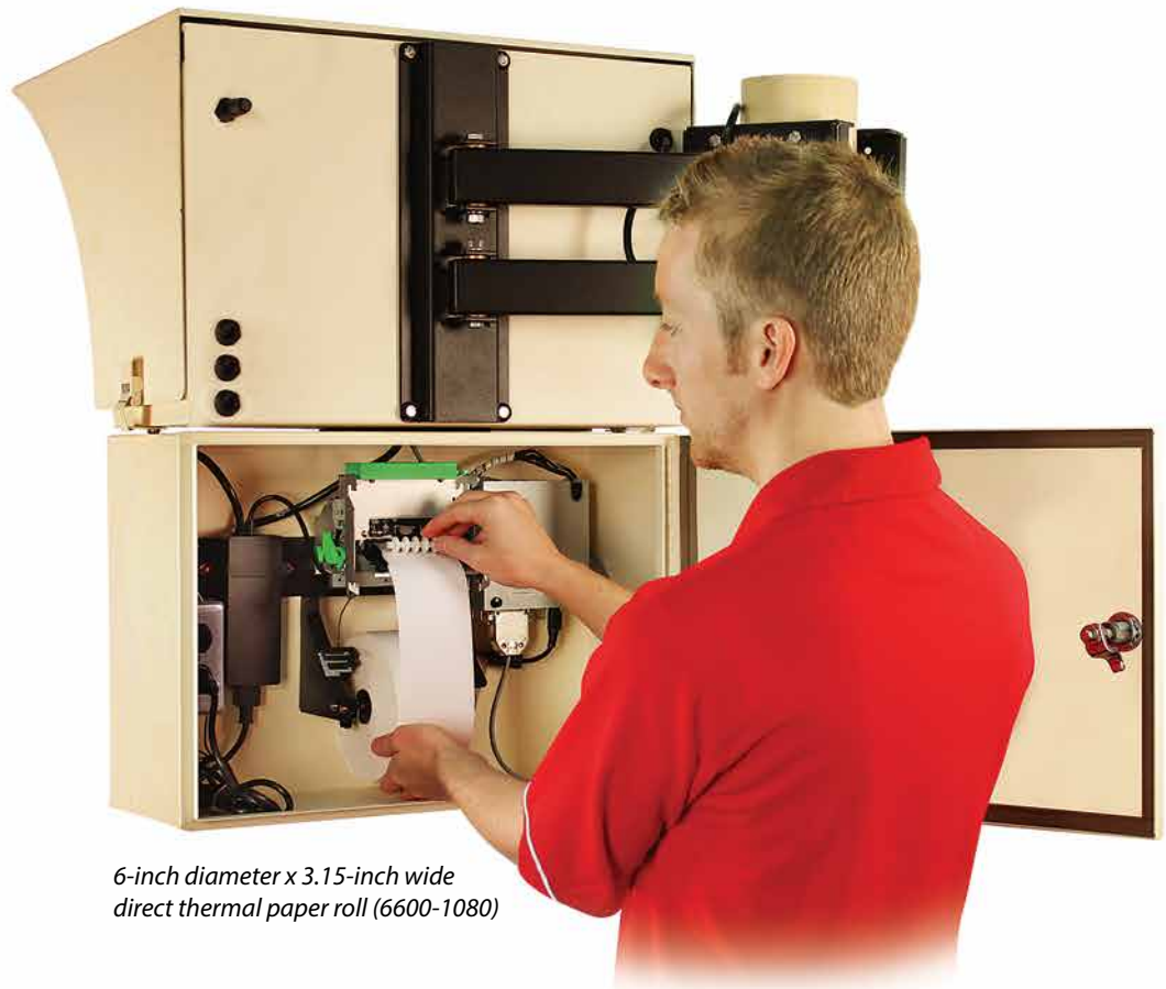
6-inch diameter x 3.15-inch wide direct thermal paper roll (6600-1080)

These unattended weighing terminals allow the driver to remain in their vehicle while weighing which reduces the risk associated with walking across truck scale platforms and traffic lanes. Not only is this a safer method of receiving truck weights, but it also speeds the weighing process for optimal efficiency and reduces overall operating costs.