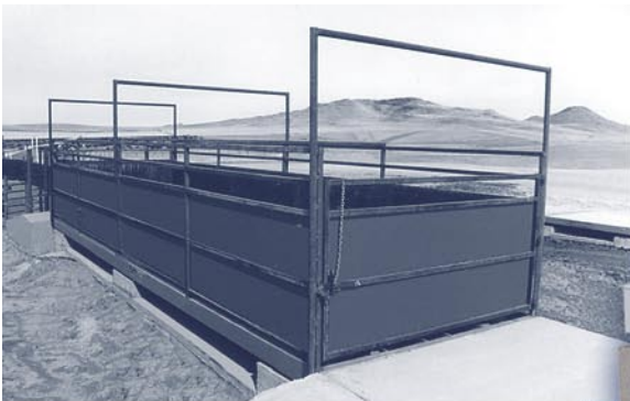
Livestock rack not included.

Cardinal's Electro-Mechanical Livestock Scales are built with structural steel levers and seamless steel tubing providing extra strength and less weight. Doublelink suspension bearings eliminate platform shock prolonging the life of the scale. Pivots are tempered high-grade tool steel and, along with self-aligning bearings, are supported throughout their entire length. Interchangeable parts and simple pit design make installation and maintenance quick and easy. Electro-mechanical livestock scales have the advantages from both electrical and mechanical scale systems combined. With the dependability of the lever system and one Cardinal strain gauge load cell, weight indication can be located away from the scale platform.