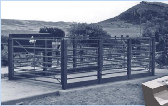
Livestock rack not included.