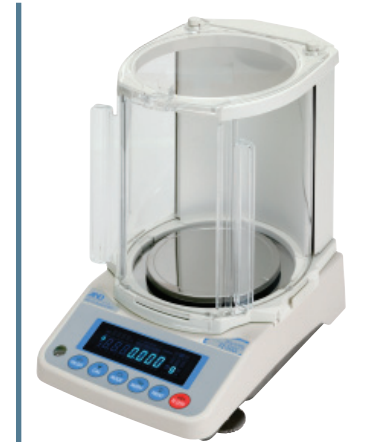
FZ-300i with optional Breeze Break FXi-11