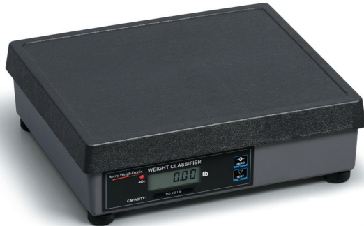
Model 7815 shown with six-digit LCD internal display