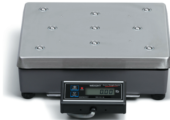
Model 7815R shown with standard 7" remote only