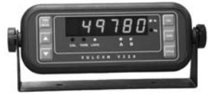
VULCAN V320 METER