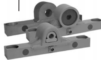
Lxx FIFTH WHEEL LOAD CELL 04 HOLLAND (3500 SERIES) 05 FONTAINE (FONTAINE 5000) 31 SIMPLEX (SIMPLEX II) WITH H11 MOUNTING KIT