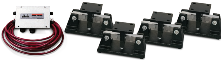
Cast iron module with RL75016 double-ended beam load cell