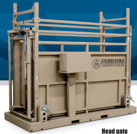
Head gate configuration