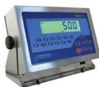
FB500 Intermediate Weighing