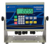
FB2255 Basic Weighing

The LSA Series offers instrumentation options designed to fit every type of application, from basic "weigh only" needs, to rate of gain tracking, ID, shrink and more.