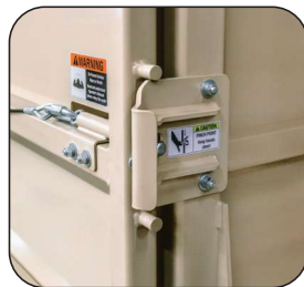
Spring-loaded Latch Assembly A heavy-duty, spring-loaded latch assembly secures the weighing enclosure after livestock are loaded.

Because livestock are known to jump and kick when being corralled, the LMA utilizes 48" tall kick panels on all sides of the scale to combat routine wear and tear and reduce the possibility of animal injury. The solid steel panels also shield outside movement from the animals' line of sight, which helps keep them calm during the weighing process. The kick plates are attached to the scale's bolt-on racks and self-latching swing gates, which are made of 2" and 3" steel tubing for longevity.