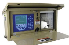
FB700 WeighCenter Advanced Weighing