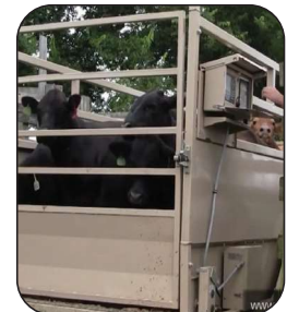
WeighCenter mounts on the LMM cage and is powered by an onboard rechargeable battery.

The LMM system includes a scale instrument and printer, housed inside a weatherproof enclosure that's conveniently mounted to the exterior of the cage for easy operator access.