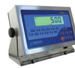
FB500 Intermediate Weighing