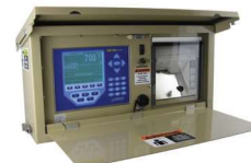
FB700 WeighCenter Advanced Weighing