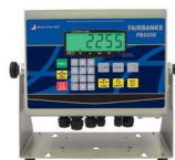
FB2255 Basic Weighing

The Fairbanks LMA Series offers instrumentation options designed to fit every type of application - from basic "weigh only" needs, to tracking head count, total weight, average weight, shrink and more.