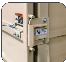
Spring-loaded Latch Assembly A heavy-duty, spring-loaded latch assembly secures the weighing enclosure after livestock are loaded.

Because livestock are known to jump and kick when being corralled, the LMA utilizes 48" tall kick panels on all sides of the scale to combat routine wear and tear and reduce the possibility of animal injury. The solid steel panels also shield outside movement from the animals' line of sight, which helps keep them calm during the weighing process. The kick plates are attached to the scale's bolt-on racks and self-latching swing gates, which are made of 2" and 3" steel tubing for longevity.